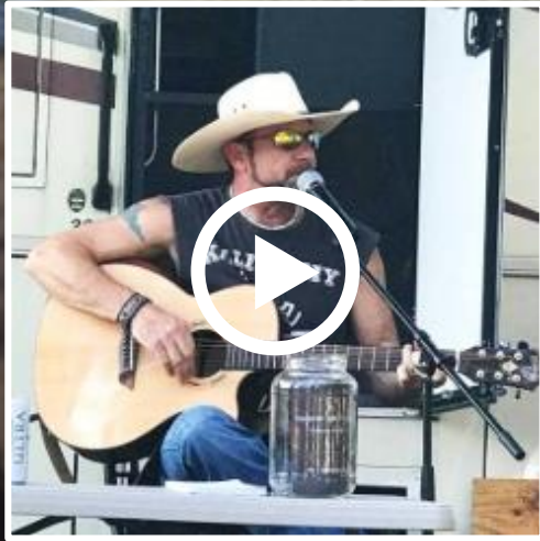
Tight Pants Boogie