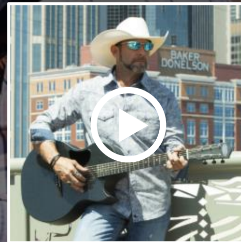
Waste My Life Away