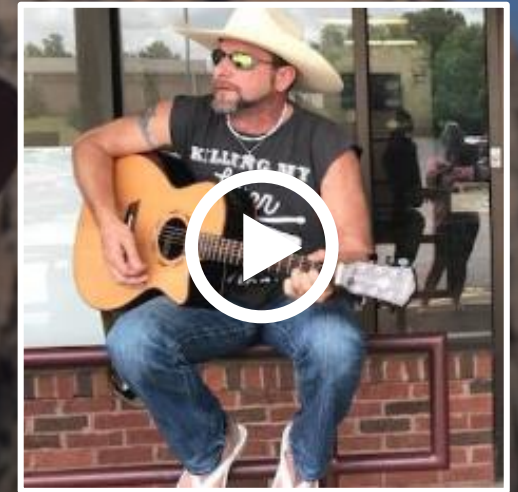
Another Beach Song